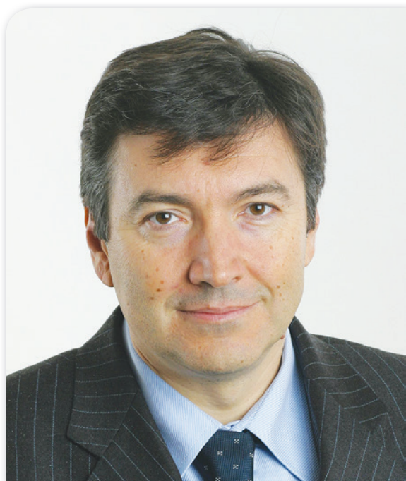
VEDRAN MORANAR, PhD, Minister of science, education and sport