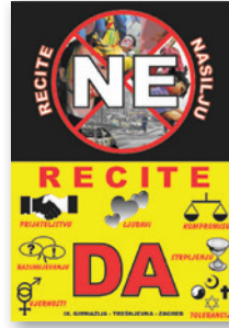
IXth High School, Zagreb, winning poster