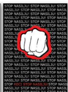
High School, Rijeka